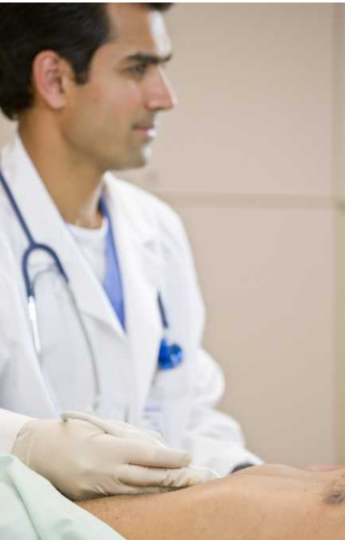
The versatile ClearVue 350 provides excellent value in ultrasound imaging.